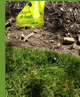
Before Turn on

During our spring turn on visit we will be offering the new Hunter Solar Sync at a reduced price. This is the latest device that will automatically adjust the controller's daily run time, based on your local weather conditions. Solar Sync measures sunlight and temperature, and uses ET to determine the correct seasonal adjustment percentage value to send to the controller. The controller then uses its programmed run time and adjusts Solar Sync's seasonal adjustment value to modify the actual irrigation run time for that day. In addition, the Solar Sync ET sensor integrates Hunter's popular Rain Clik™ sensor to provide a quick response that will shut down your irrigation system during rain. The Solar Sync is compatible with most Hunter controllers and applicable to both residential and commercial systems.